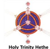
Holy Trinity Hethe

The Parishes of the Immaculate Conception & Holy Trinity are part of the Archdiocese of Birmingham: Registered Charity No: 234216