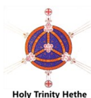
Holy Trinity Hethe

COFFEE & TEA IC Sunday's After 9am and 11am Masses HT after 10 am Mass