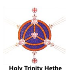
Holy Trinity Hethe