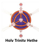
Holy Trinity Hethe

COFFEE & TEA IC Sunday's After 9am and 11 am Masses HT after 10 am Mass