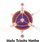
Holy Trinity Hethe