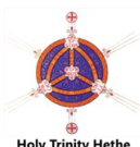
Holy Trinity Hethe

Gospel (Mark 10: 17-30). We are presented with the case of a good young man who refuses to follow Christ because he is unwilling to give up his wealth.